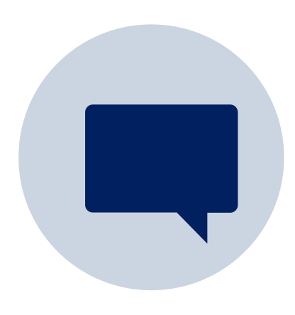
Comments due August 22